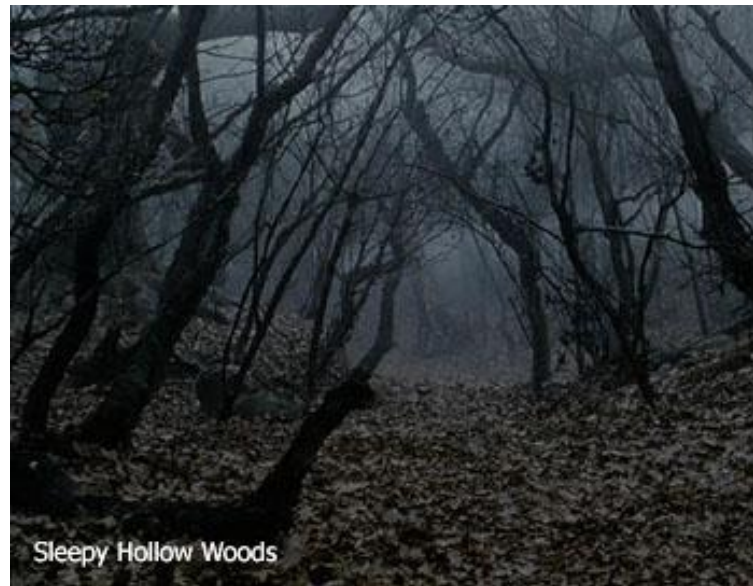
Sleepy Hollow Woods

Is it purely a coincident that so many mystical beings have gathered in this Californian town? Or is there some sort of