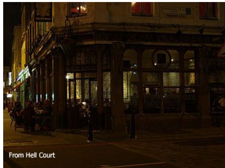
From Hell Court

According to locals, the vampires live mainly in the Sleepy Hollow Woods, but also hunt in From Hell Court. There have been several reports of prostitutes killed by vampires in the area.