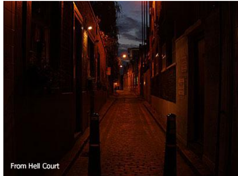
From Hell Court

Other examples of Deppville citizens with magical powers are the Irish pirate witch with telekinetic powers, the witch sister of the 'dreamer's' wife, and quite possibly other kinds of mystical beings.